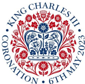
1 - Quedgeley Coronation Parade Sunday 7th May